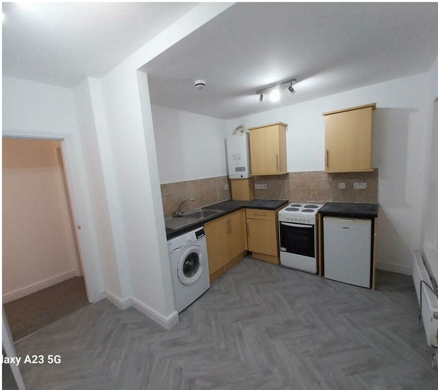
Galaxy A23 5G