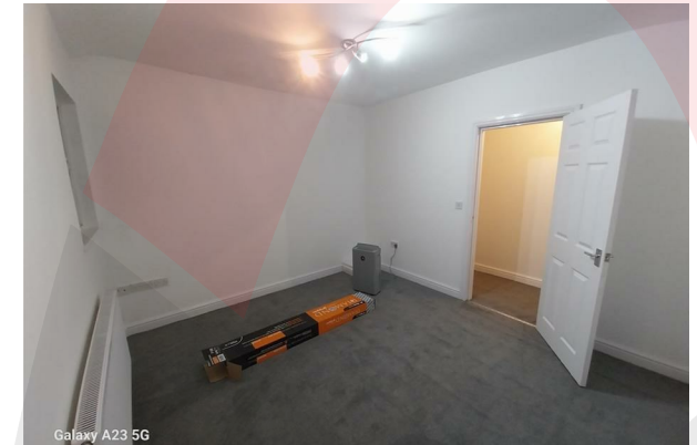
Galaxy A23 5G