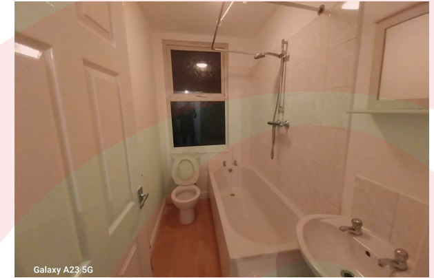
Galaxy A23 5G